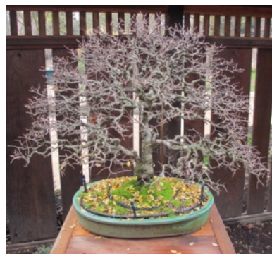
John Naka's Broom Catlin Elm in a rare full winter silhouette CBCS # 010