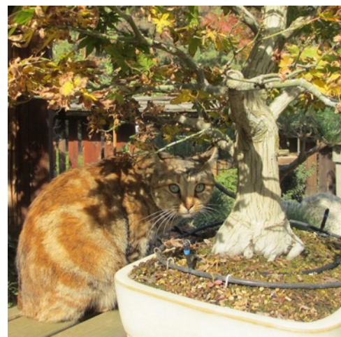
Miko on guard duty. Squirrels, beware!

Jan. 1, 5 and 6, the bonsai garden will also feature a variety of traditional Japanese New Year's children's games for our visitors to enjoy. Consult the Shōgatsu book in the bonsai garden for instructions.