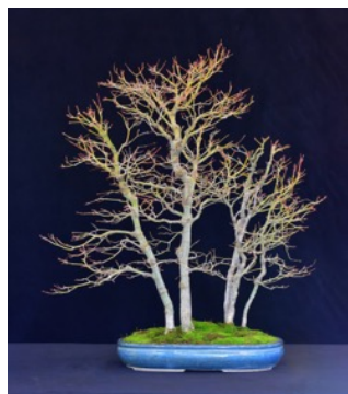
Irene Tamura's Forest Japanese Maple CBCS # 090